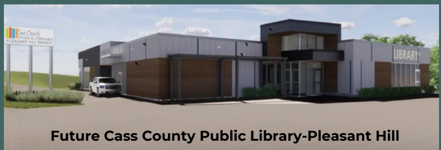
Future Cass County Public Library-Pleasant Hill

Public libraries are a vital part of our communities and the City of Pleasant Hill is excited to see this project underway.